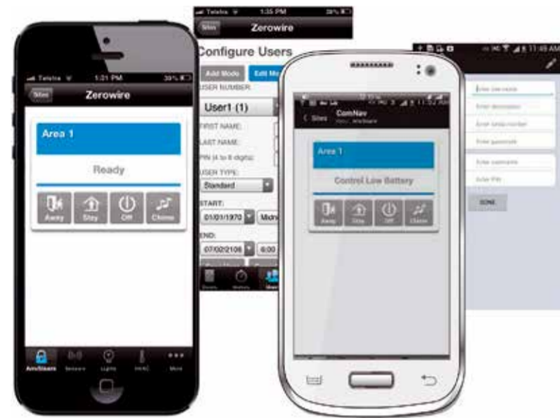
NetworX Services UltraConnect: Cloud connection for interactive services and alarm reporting